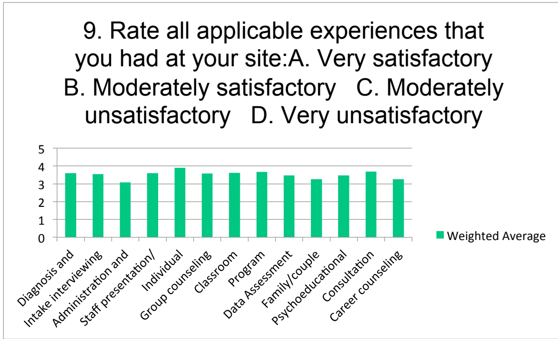
Figure 3. Students' Overall Satisfaction with the Site Experience