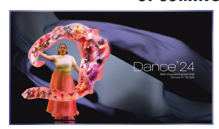
Dance '24 Feb 16-18, 2024 NKU Greaves Concert Hall