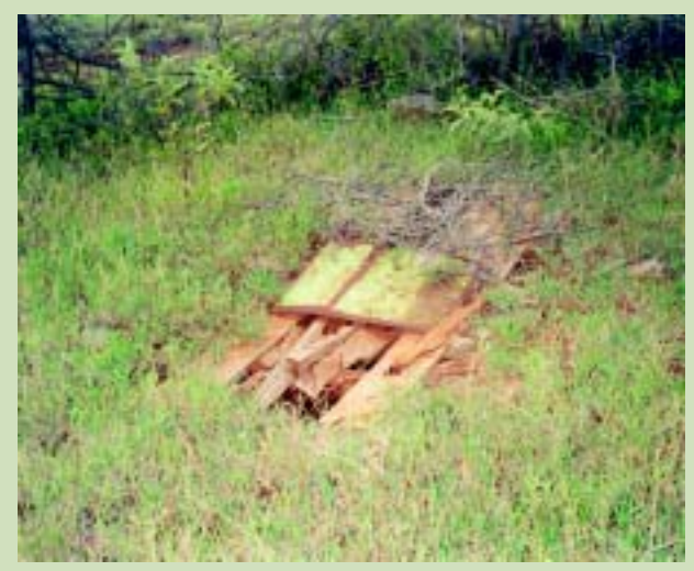
Abandoned open air toilet in the Masai area of Kjiado.

The communities selected have different excreta disposal practices some of which are influenced by traditional beliefs. The Digo in Kwale are mainly Muslims and their excreta disposal practice is influenced by availability of water and the belief that people are not supposed to excrete in houses (including pit latrine structures). The Kikuyu community believes that an improved excreta disposal facility enhances one's image in the society. It is also culturally accepted that if one wants to build a house, one starts by building a latrine for use by the builders. Nyeri district therefore enjoys the highest coverage of sanitation facilities in the country. The Masai are a pastoral people moving with their cattle to find new pastures. They do not build toilets, but have been known to use them in the vicinity of watering holes where they temporarily congregate.