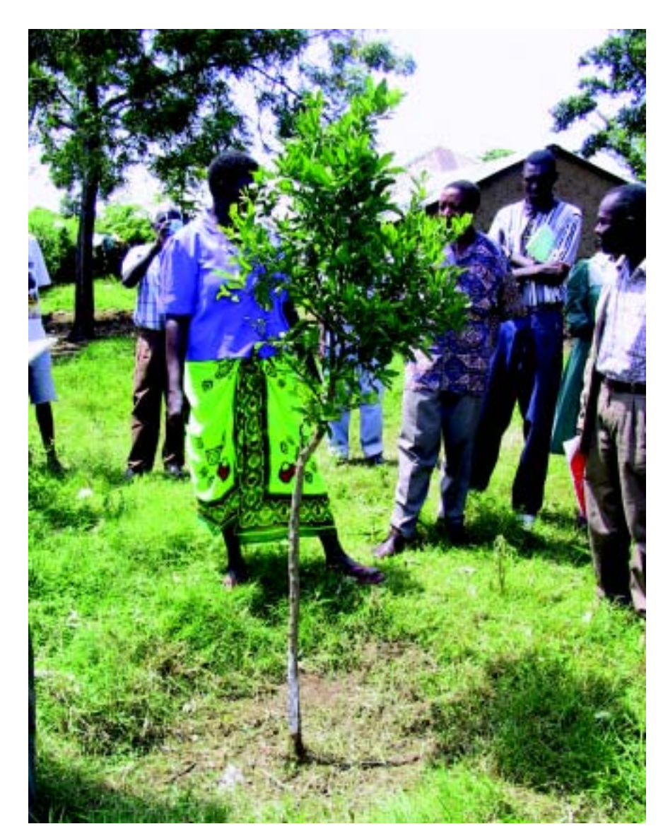
This household in Kusa, Kenya has used excreta as manure to grow this tree.

the main constraint towards achieving coverage, analysis and observation show that even the poorest can still afford pit latrines. More than 50% of those not covered were also willing to pay for improvements.