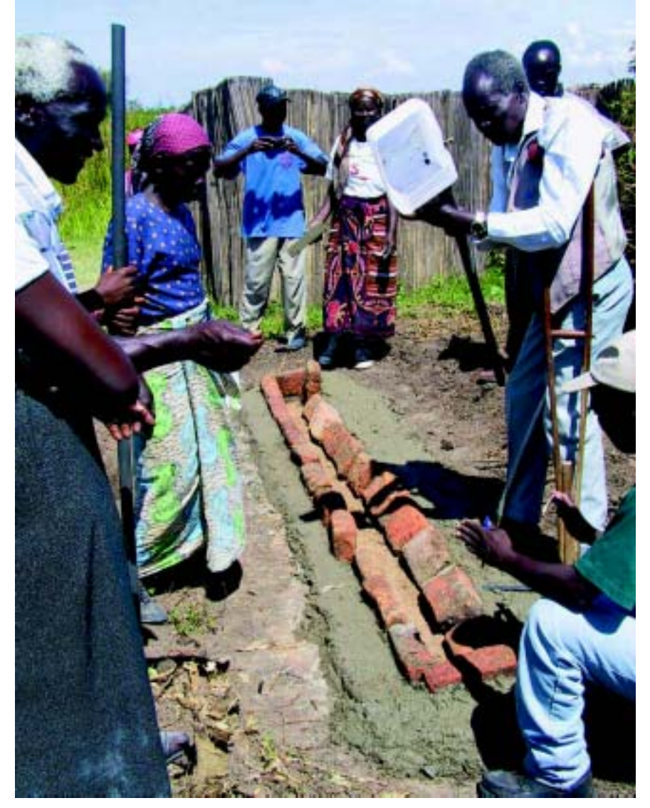
A community self-help group constructing a urinal at a fish landing site at Lake Victoria, Kenya.