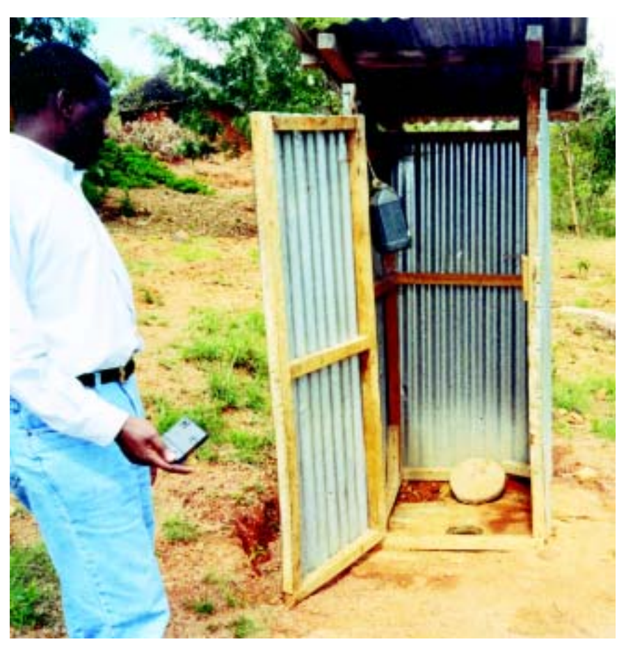
An example of an Arborloo.

The main current motivation to build latrines is increased health and hygiene