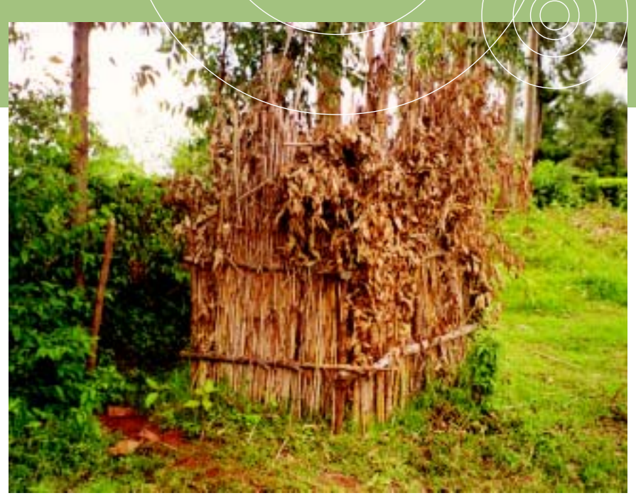
A simple pit latrine built using locally available materials.

This study was sponsored by WSP-AF and forms part of a series being carried out in a number of countries including Kenya. The purpose was to collate information on interventions and trends that show relative success in improving sanitation and change in hygiene behavior, and how these lessons may