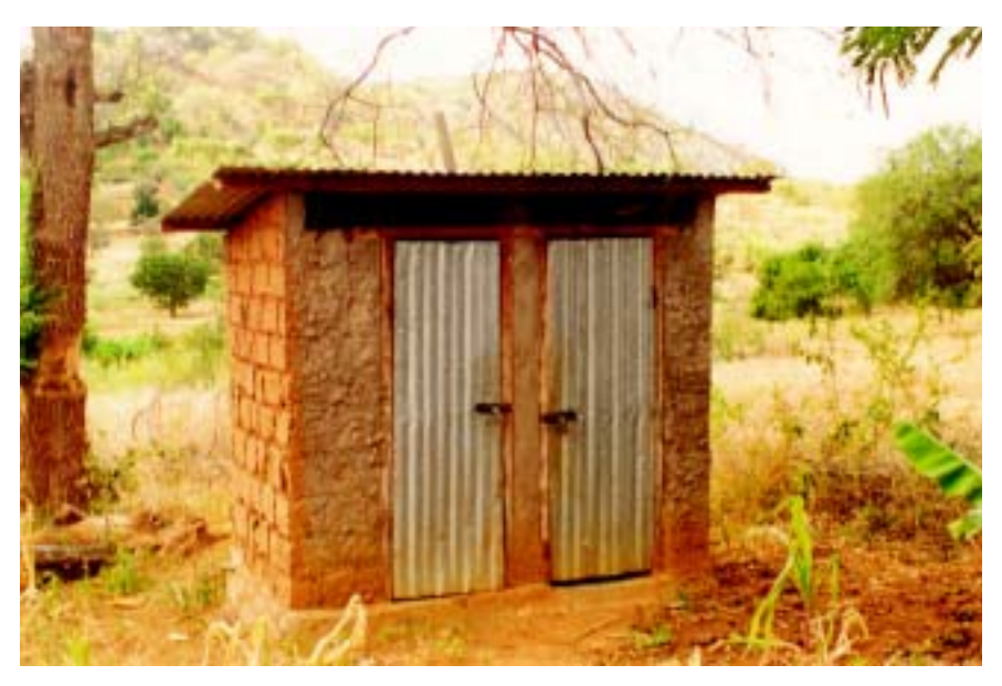
An example of a VIP.

■ The Kenya 1999 population and housing census showed access to sanitation facilities to be 82%. Coverage data from this study is consistent with these findings. However, the Ministry of Health puts the national coverage of