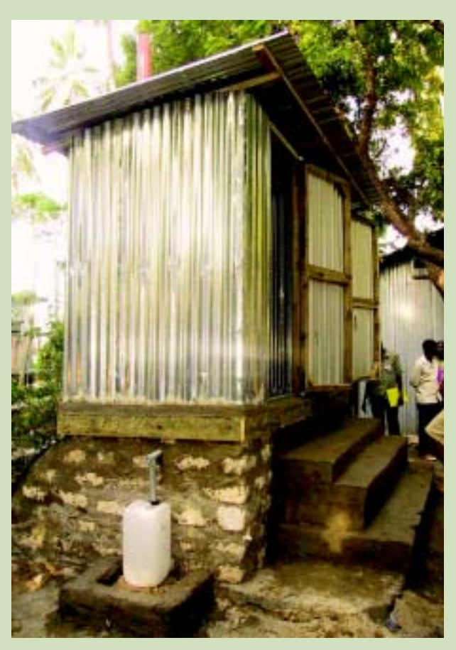
A urine diversion toilet near Mombasa where the jerrycan is used as a urine container.

Fossa Alterna and Arborloos work best when quantities of soil, wood ash and leaves are added periodically to produce a balanced compost. Skyloos require some ash to dry the faeces and increase pathogen destruction.