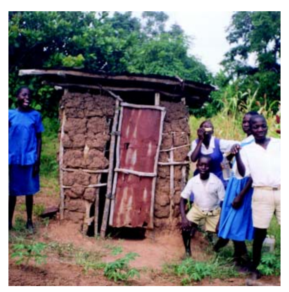
A poorly constructed pit latrine.

privacy and convenience than did other groups.