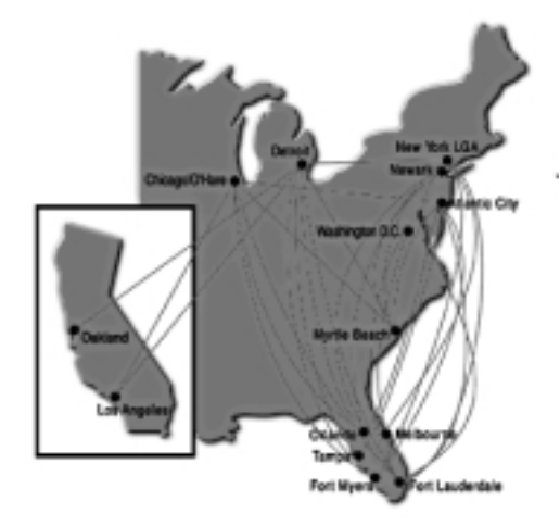
Figure 4: Route Map for Spirit Air -- May 2001

8. What is the largest number of flights you would need to get from one Spirit city to another? Which trips take the largest number of flights? How many ways can you make those trips?