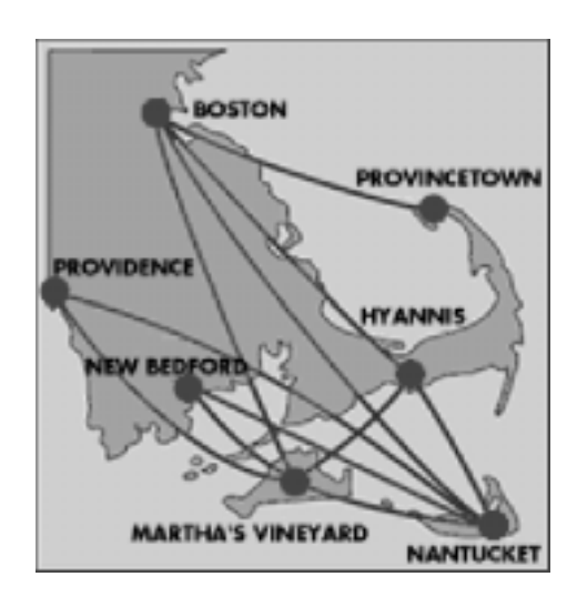
Figure 2: Northern Route Map for Cape Air -- May 2001

Another example of a graph is the route map that most airlines (or railways) produce. A copy of the northern route map for Cape Air from May 2001 is Figure 2. This map is available at the web page: www.flycapeair.com. Here the vertices are the cities to which Cape Air flies, and two vertices are connected if a direct flight flies between them.