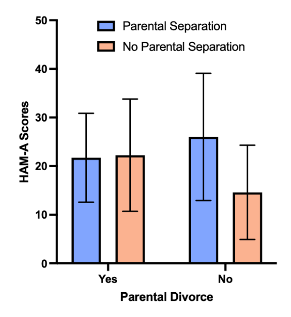
Figure 2. Students' anxiety ratings in comparison to parental separations. Students who have witnessed a parental separation (M = 23, SD = 11), compared to students who have not witnessed a parental separation (M = 16, SD = 10). t(68) = 2.83, p = 0.0061.